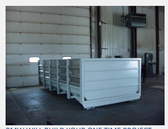
PMW WILL BUILD YOUR ONE TIME PROJECT

PMW has grown its worldwide customer base with added value as a contract manufacturer of car wash canisters, mufflers, agricultural equipment, and various aqueous equipment.